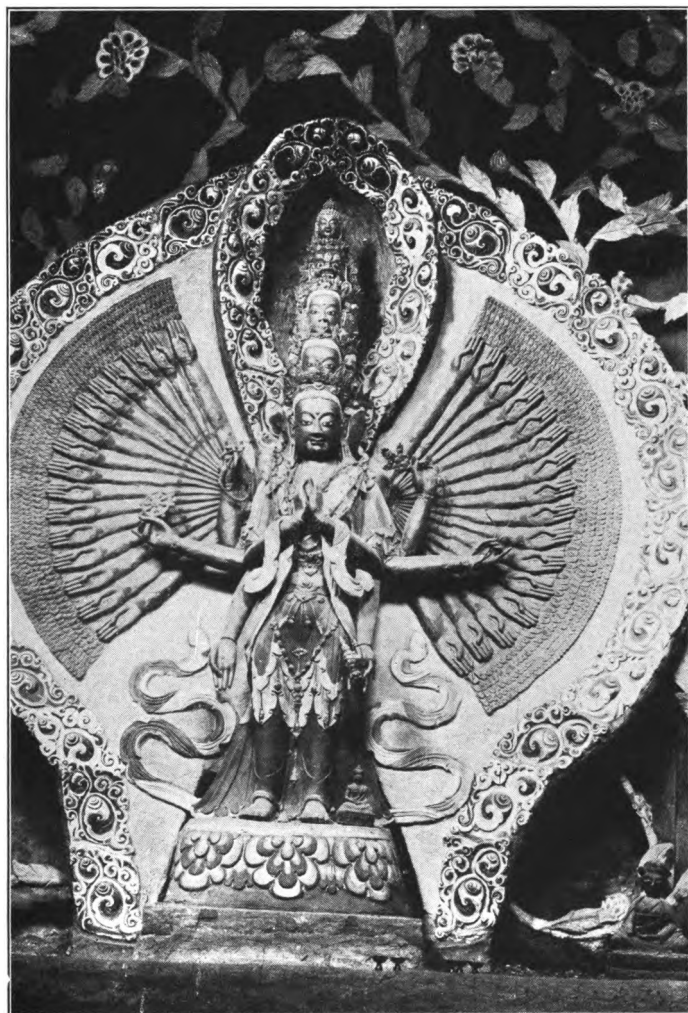
ONE OF THE IMAGES IN YARA GONG TEMPLE